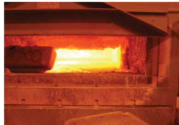
Above: Diecast manufacturers count on HWI's products to produce consistent results under intense demands.