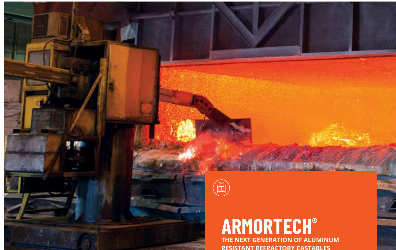
ABOVE: HWI refractory solutions perform in the most severe conditions in the secondary aluminum process.

This 85% alumina, phosphate bonded material offers the advantages of a gunned lining with the excellent physical properties of plastic refractories. GREENGUN® is cement free and offers alkali, thermal shock, and abrasion resistance. This advanced material is designed to be installed rapidly, hot or cold, to minimize turnaround time.